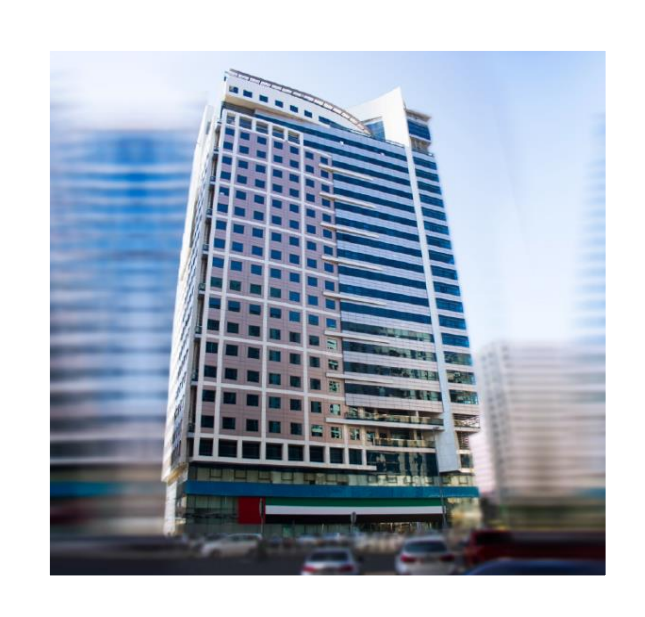
DU BUILDING ABU DHABI